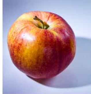
the left side