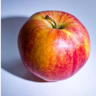
the right side