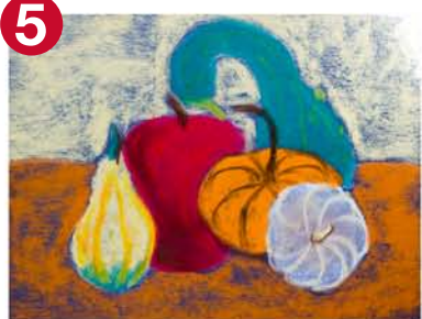
Color the background. Choose two colors and use one for the table and one for the wall. You can place your pastel on its side and use it to shade. If you do, make sure you do not smudge your picture too much, be careful.

Add some details: more colors, patterns, shapes. You should not see any white lines (aside from the horizon).